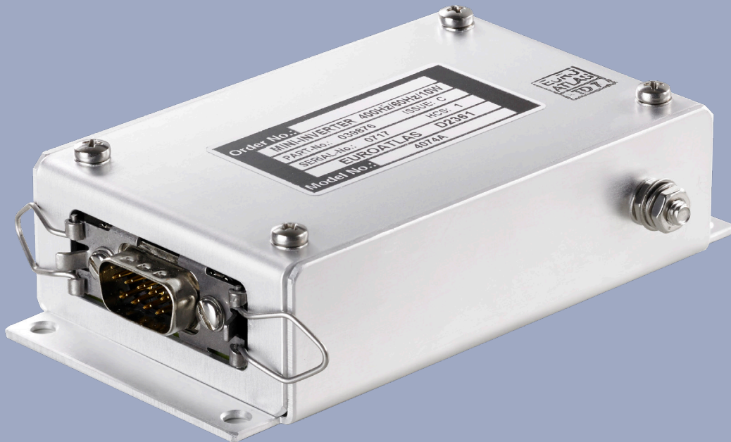
Mini Frequency Converter, 10 VA, Model 4074A